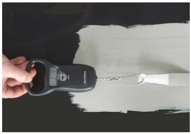
Figure 2 - Digital scale used to evaluate adhesion

In the field the adhesion test can be done using a small fish scale such as the one shown in Figure 2. Attach the scale to the "tail" that was left uncoated and pull slowly on the scale, pulling the 1" wide fabric away from the substrate. Record the weight (force) that is required as the fabric strip is pulled away.